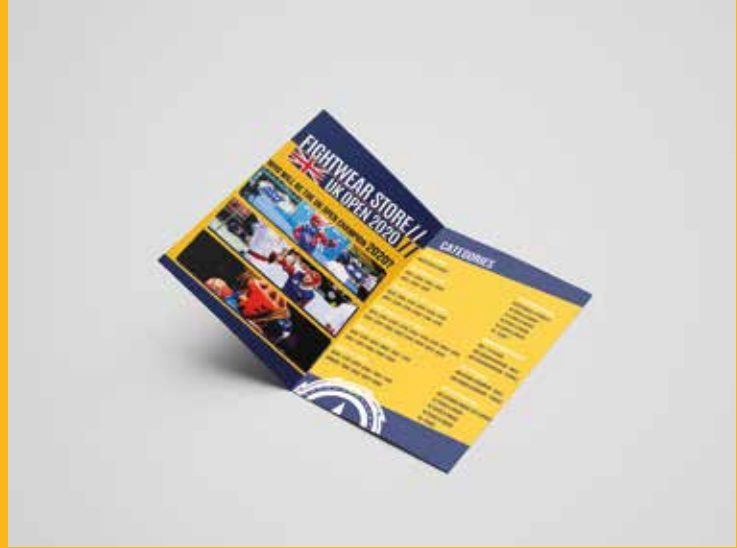
FOLDER FLYER / POSTER